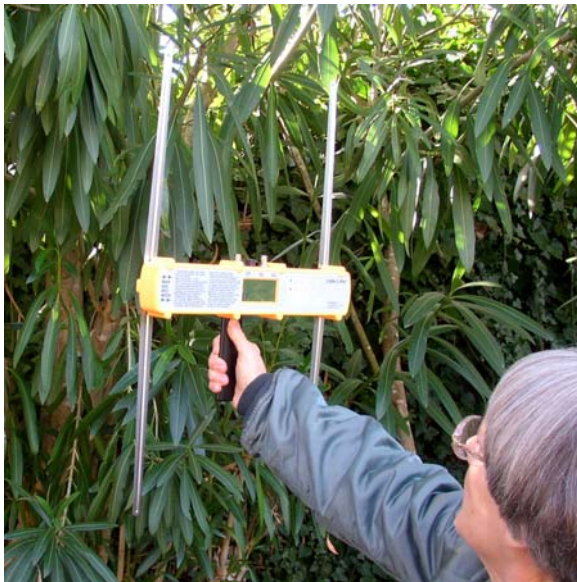
Figure 2. Operating Position for all Frequencies.

ALWAYS set the antenna blades as shown in Figure 2.